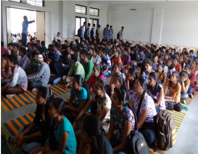
Student Gathering for the Program

In Government Engineering College, Bharuch the day was celebrated with enthusiasm by all the students and teachers. More than 100 students of GEC, Bharuch vigorously participated in the program and enjoyed the celebration. The students of Govt. Polytechnic, Rajpipla also joined GEC students for the celebration.