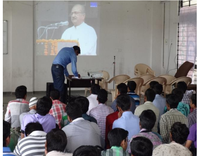
Speech by Education Minister Shree Bhupendrasinh Chudasma

The live telecast began with the introductory speech of our Education Minister Shree Bhupendrasinh Chudasma. He expressed the importance of the teacher in our society. He also emphasized the roles and duties of a teacher in our society. He said that the teacher should present himself as an example of good character and inspire others to do the same. He further suggested the role of a teacher in shaping the society. His speech was followed by the felicitation program in which the selected best teachers of the state were given a certificate of honor and shawl by honorary Chief Minister of Gujarat and Governor of Gujarat.