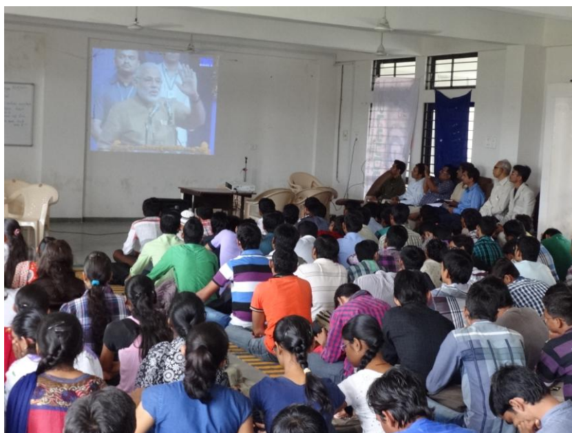
Staff and Student Enjoying Speech by Hon. CM

This program was followed by the speech of Hon. Chief Minister Shri Narendra Modi. He mentioned the contribution of Dr. Sarvapalli Radhakrishnan in the field of education. He further announced a scheme of expanding the scope of the celebration of the day and suggested to promote the best teachers with better prizes and also suggested to form special committee that would select the best teachers. He emphasized the need for the devoted teachers in our society and proposed the exploratory idea of learning as more important than conventional ways of teaching. The speech was followed by Hon. Governor Smt. Dr. Kamla Beniwal. She suggested a few important points of reference beneficial for our society. She showed a better correlation between education and democracy. She also suggested that better education leads to better democracy. The speech was followed by our national anthem.