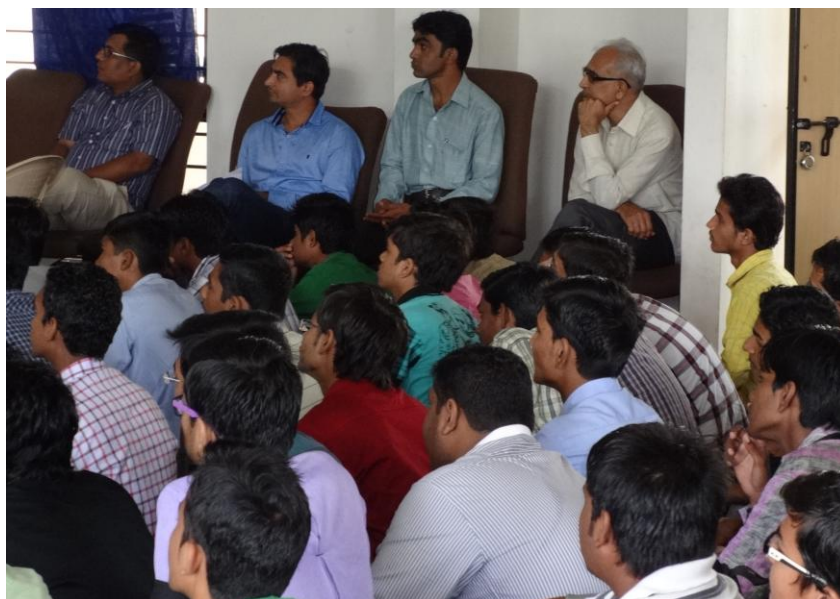
Staff and Student Enjoying Speech of Hon'ble CM

The live telecast began with the introductory speech of our Education Minister Shree Bhupendrasinh Chudasma. He expressed the importance of the teacher in our society. He also emphasized the roles and duties of a teacher in our society. He said that the teacher should present himself as an example of good character and inspire others to do the same. He further suggested the role of a teacher in shaping the society. His speech was followed by the felicitation program in which the selected best teachers of the state were given a certificate of honor and shawl by honorary Chief Minister of Gujarat and Governor of Gujarat.