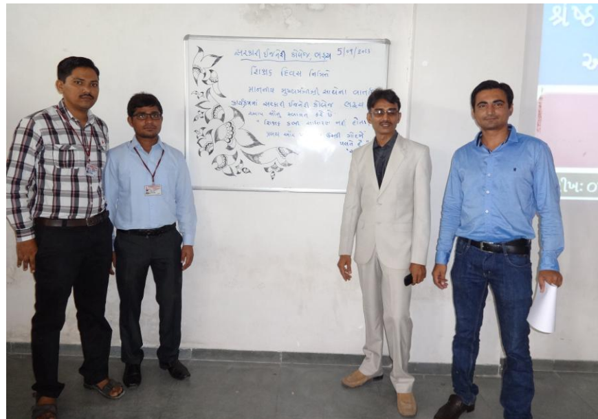
Nodal Officer With Team Member.

Every year teacher's day is celebrated in memory of Dr. Sarvapalli Radhakrishnan. In Gujarat, this day is celebrated with enthusiasm in which the entire body of education takes part and celebrates it together. The day is celebrated by all the teachers, students and they are encouraged not only by the education minister and the Governor of Gujarat but also by our honorable Chief Minister. The program is celebrated in Gandhinagar, Gujarat and live telecast is provided by BISAG to all the schools and colleges of Gujarat. All the schools and colleges participate in the celebration.